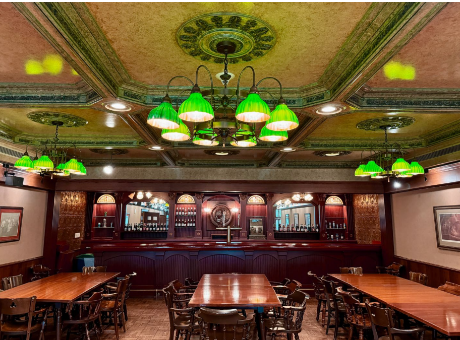
HIGH LIFE ROOM