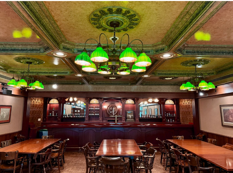
HIGH LIFE ROOM